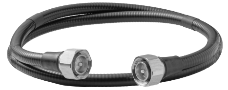
f. e. 43M43MS38-0100FFP

Radio Frequency Systems' CELLFLEX® Factory-Fit Jumpers feature specially designed connectors which are soldered-on in a strictly controlled industrial process to ensure industry leading performance for today's high-performance wireless systems. The connector design and manufacturing process has been optimized to produce premium VSWR and IM levels. Injection molded boots provide reliable and repeatable additional sealing level and strain relief. Our facilities produce and stock all popular lengths as required by the industry, and can deliver custom lengths with premium VSWR and IM levels on request.