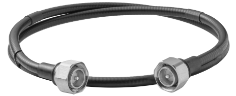
f. e. 43M43MS14-0100FFP

Radio Frequency Systems' CELLFLEX® Factory-Fit Jumpers feature specially designed connectors which are soldered-on in a strictly controlled industrial process to ensure industry leading performance for today's high-performance wireless systems. The connector design and manufacturing process has been optimized to produce premium VSWR and IM levels. Injection molded boots provide reliable and repeatable additional sealing level and strain relief. Our facilities produce and stock all popular lengths as required by the industry, and can deliver custom lengths with premium VSWR and IM levels on request.