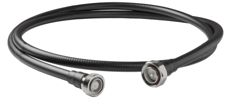
7M7F512F-0400FFP for EXAMPLE

Radio Frequency Systems' CELLFLEX® Factory-Fit Jumpers feature specially designed connectors which are soldered-on in a strictly controlled industrial process to ensure industry leading performance for today's high-performance wireless systems. The connector design and manufacturing process has been optimized to produce premium VSWR and IM levels. Injection molded boots provide reliable and repeatable additional sealing level and strain relief. Our facilities produce and stock all popular lengths as required by the industry, and can deliver custom lengths with premium VSWR and IM levels on request.