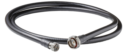
7M43MS12-0600FFP for EXAMPLE

Radio Frequency Systems' CELLFLEX® Factory-Fit Jumpers feature specially designed connectors which are soldered-on in a strictly controlled industrial process to ensure industry leading performance for today's high-performance wireless systems. The connector design and manufacturing process has been optimized to produce premium VSWR and IM levels. Injection molded boots provide reliable and repeatable additional sealing level and strain relief. Our facilities produce and stock all popular lengths as required by the industry, and can deliver custom lengths with premium VSWR and IM levels on request.