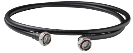
7M7MRL12F-0300FFP for EXAMPLE

Radio Frequency Systems' CELLFLEX® Factory-Fit Jumpers feature specially designed connectors which are soldered-on in a strictly controlled industrial process to ensure industry leading performance for today's high-performance wireless systems. The connector design and manufacturing process has been optimized to produce premium VSWR and IM levels. Injection molded boots provide reliable and repeatable additional sealing level and strain relief. Our facilities produce and stock all popular lengths as required by the industry, and can deliver custom lengths with premium VSWR and IM levels on request.