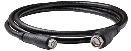
7MB43MBL12-0500FFP for EXAMPLE

Radio Frequency Systems' CELLFLEX® Factory-Fit Jumpers feature specially designed connectors which are soldered-on in a strictly controlled industrial process to ensure industry leading performance for today's high-performance wireless systems. The connector design and manufacturing process has been optimized to produce premium VSWR and IM levels. Injection molded boots provide reliable and repeatable additional sealing level and strain relief. Our facilities produce and stock all popular lengths as required by the industry, and can deliver custom lengths with premium VSWR and IM levels on request.