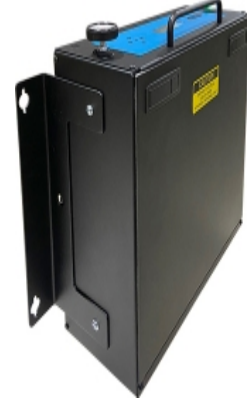
BD210WLP-V / BD212WLP-V