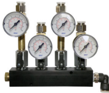
PWM4G : 4-Port Manifold with Pressure Gauges