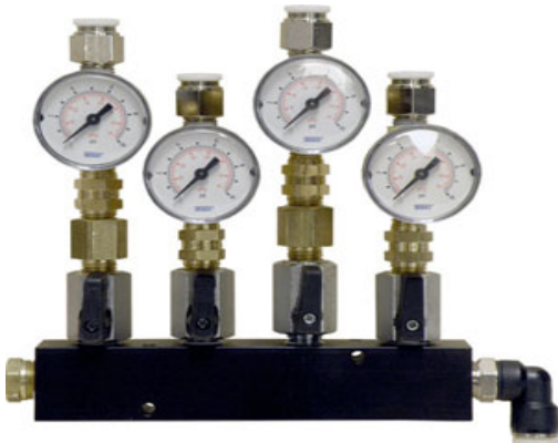
PWM4GC : 4-Port Manifold with Pressure Gauges & Check Valves

Start-up and Manifold Kits - GLK and MLK, and Maintenance Kits