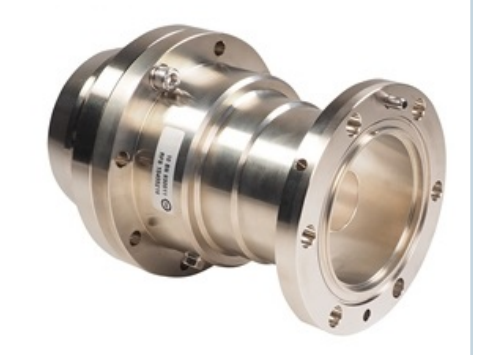
318EIA Connector for HCA400 Cable