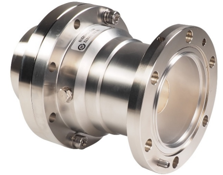
318EIA Connector for HCA300 Cable