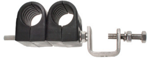
picture shows MBHS78-2-F for illustration purpose