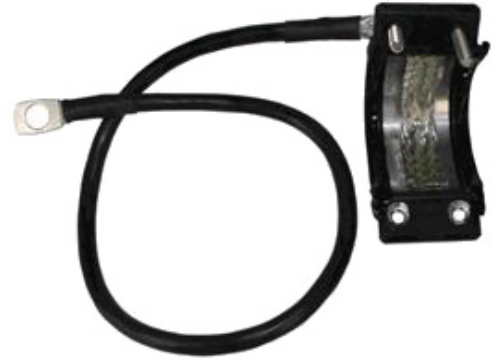
GKSPEED20-78P shown for illustration